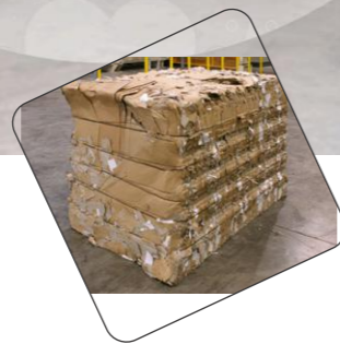
OCC Cardboard Bale