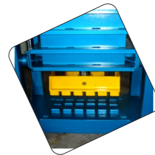
Four Sides Strapping