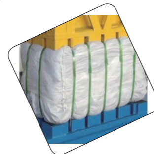
Used Cloth Bale