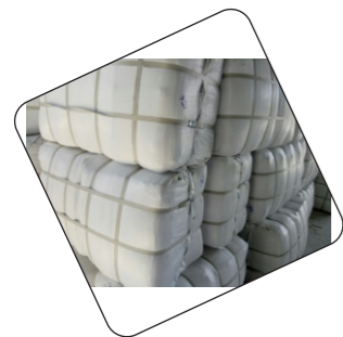
Cloth Bale HDPE Bag Bale